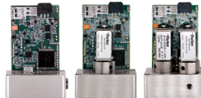
EPC pressure controllers for OEM manufacturers

Manufacturers and labs all over the world depend on Alicat Scientific's high precision electronic mass flow meters and controllers and pressure meters and controllers.